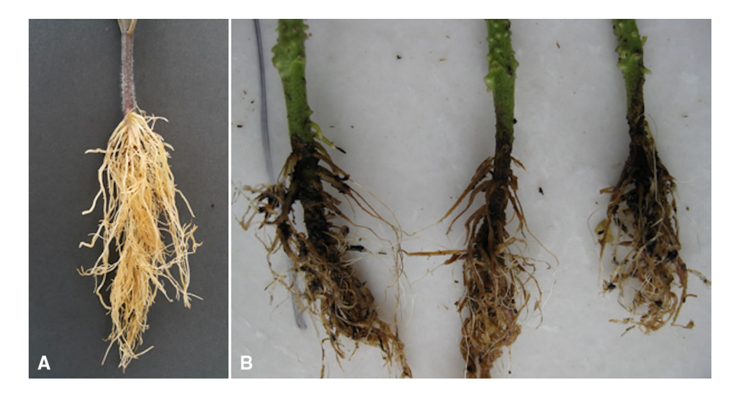
Fig. 1 Healthy and FORL -infected tomato roots. The roots of seedlings at one true leaf stage were washed off substrate, dipped in a suspension of 10^7 spores/ml. Seedlings were then transplanted in

DNA from twenty resistant and twenty susceptible F_2 lines was pooled in equal concentrations to make up the